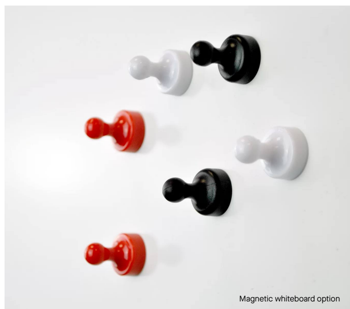
Magnetic whiteboard option

Whether creating a pop-up meeting nook, shielding a workspace from view, or supporting focussed work, Wheelie Screen adapts instantly to changing spatial needs.