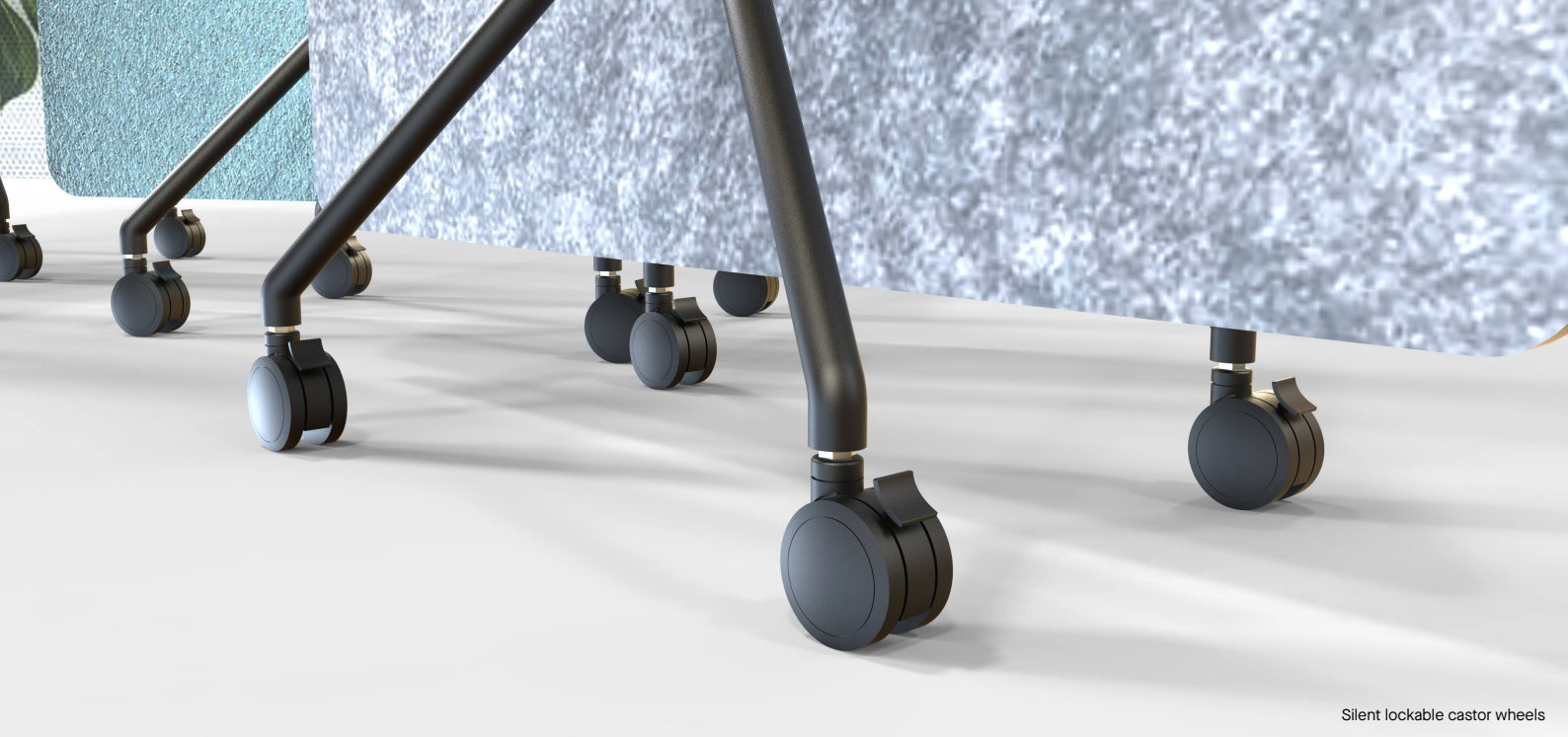
Silent lockable castor wheels